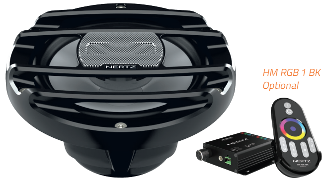
HM RGB 1 BK Optional